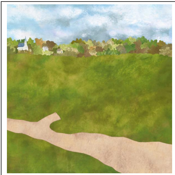
Background fabric included in kit Barn, quilt and Quilts for Sale sign also included as shown above